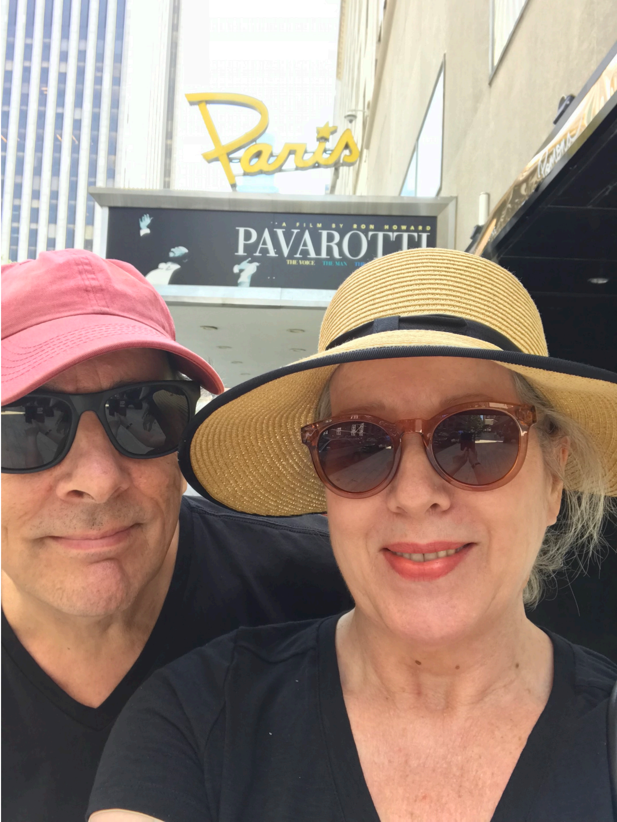
A & R Selfie, NYC 2019